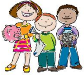
Sharing what I have earned

I would like to PLEDGE that I will give $ _____ (CIRCLE ONE: weekly monthly one time) to support God's work through my church.